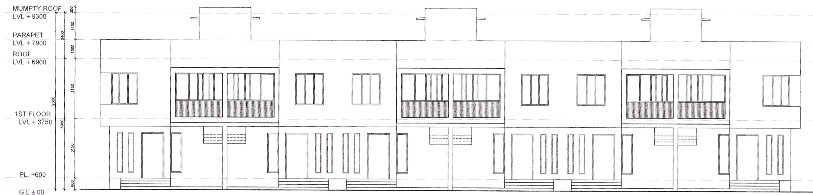
FRONT SIDE ELEVATION SCALE - 1:100